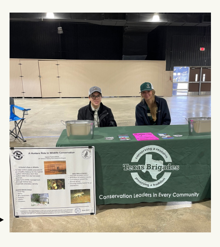
Graduates presented their poster and shared their Texas Brigades experience at the Harris County Fair and Rodeo; October 2022.