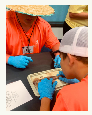
Participants engage in a squid dissection demonstration with Volunteers from Sea Turtle, Inc.