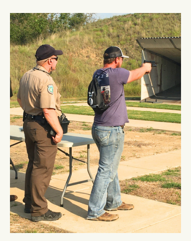
Participant practicing live range skills and safety instruction.